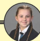
Eden - Year 8

Showing great creativity and technical skills in coursework, resulting in an excellent project